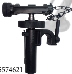
5574621 MECHANISM ASSY, TRAV & ELEV