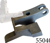
5504060 LEVER, MANUAL CONTROL