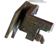
5577409 STOP, ASSY, CARTRIDGE REAR